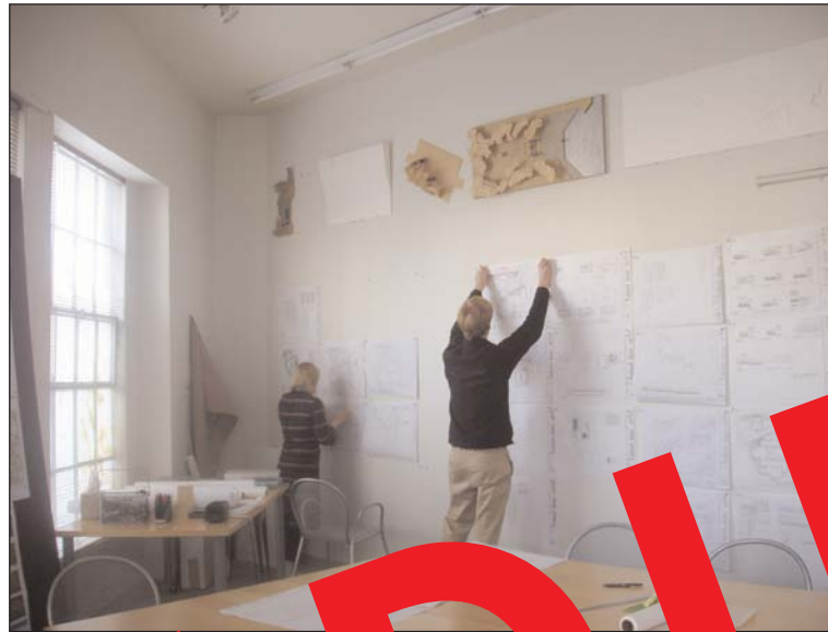
Lots of Natural Light